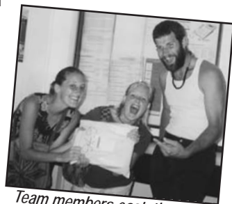
Team members ecstatic about receiving their mail packet!