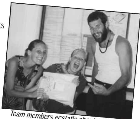
Team members ecstatic about receiving their mail packet!